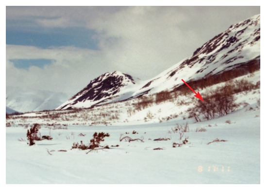
Figure 4. Tree nest site of the Gyrfalcon in Kamchatka (Photo by A. Gorovenko).

Nest Site Availability. —A total of 91.2% of the Kamchatka Peninsula is suitable for Gyrfalcon breeding. In 2005–2007, we made a survey of cliff outcrops. The majority of the cliff outcrops were located in the foothills and mountains, as well as in the isolated mountain massifs and volcanoes. The sources of most of the rivers have a great abundance of cliffs. Lowlands and wide river valleys are usually forested and lack cliffs, or have a small number of cliffs on the banks. On average, there is one cliff outcrop per 32 km2 of area, with some areas where there is one cliff per 0.8 km2. This indicates that there is no lack of