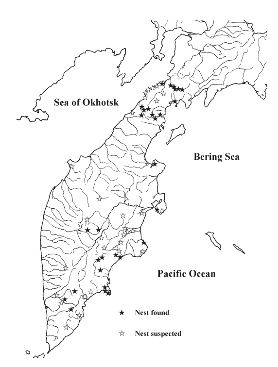
Figure 1. Map of the nest locations in Kamchatka Peninsula.

Extrapolating from the density of Gyrfalcons recorded by the counts in the study areas, we estimate 500 (330–660) pairs (approximately 2.4 pair per 1000 km<sup>2</sup>), which constitutes 7–19% of the total number of this species in the Russian Federation and 3–8% of the entire world Gyrfalcon population. Results of the counts in 2007 demonstrated a 1.5 times decrease in the numbers of the birds breeding in the southern part of Kamchatka. The Gyrfalcon is most numerous in the mountainous parts