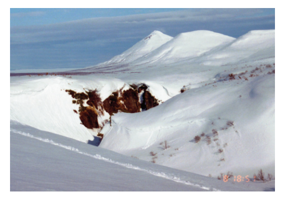
Figure 3. Cliff nest site of the Gyrfalcon in Kamchatka.

- KAMCHATKA GYRFALCON POPULATION STATUS -